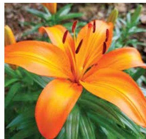
Orange Day Lily