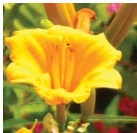
Yellow Day Lily