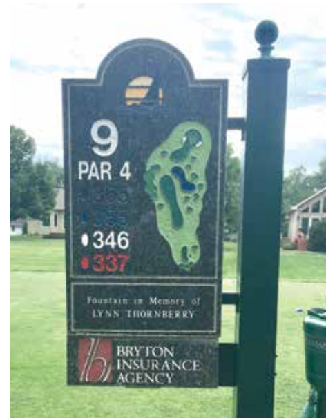
SUSAN THOMPSON | LAKE PANORAMA TIMES

Two holes remain available for sponsorship — 10 and 12. Annual sponsorships are $500. New sponsors also are asked