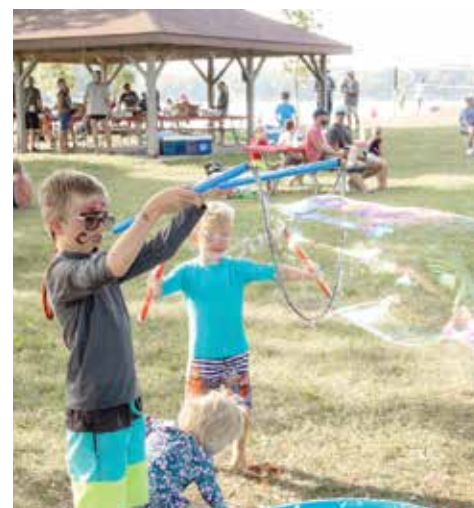
Kids attending the July 2 Taste of Hope event went through nine gallons of giant bubble mix.