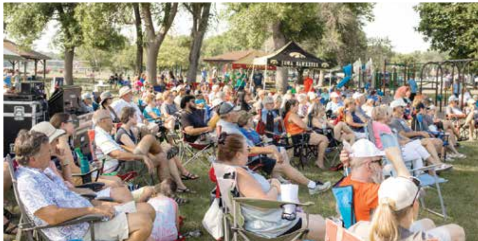
An estimated 300 people attended the hour-long worship service at Taste of Hope on July 2 at Boulder Beach.