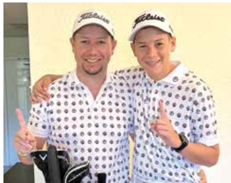
SPECIAL TO LAKE PANORAMA TIMES

"It's awesome what groups in the United States are doing to get kids involved in golf. It was a great opportunity for Ruben-hein to be able to play in two tourna-