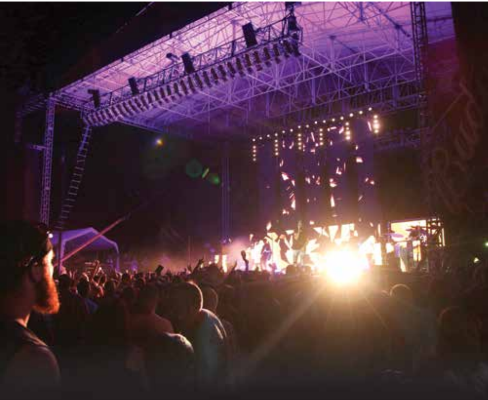
LAKE PANORAMA TIMES FILE PHOTO