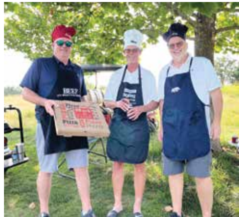
SPECIAL TO LAKE PANORAMA TIMES

Fifteen teams competed in a four-person best-shot tournament. "That's Amore" and a trip across Italy was the