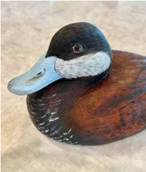
SPECIAL TO LAKE PANORAMA TIMES

Proceeds from Gala ticket sales, as well as the live and silent auctions, go toward Tori's Angels' mission of supporting families with children suffering from life-threatening medical conditions. To date, the foundation has accepted more than 125 children with life-threatening illnesses and currently