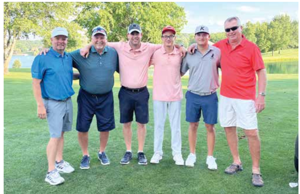
SPECIAL TO LAKE PANORAMA TIMES

a non-profit, all-volunteer organization, with all overhead and benefit expenses paid by the foundation board members and friends. ■