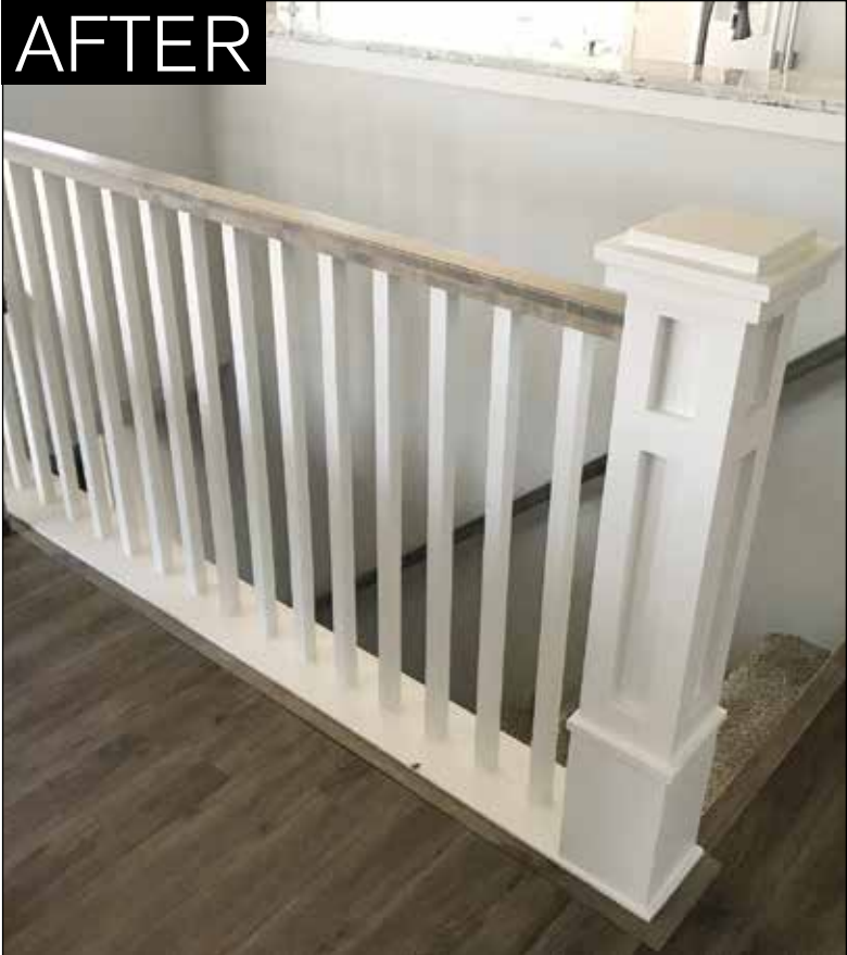
The staircase has a modern feel now with the renovations of the Tofteland home.