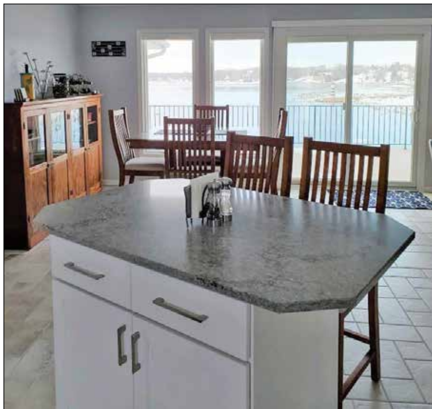
From the kitchen, the DeBruins can gaze out and enjoy a view of the lake.