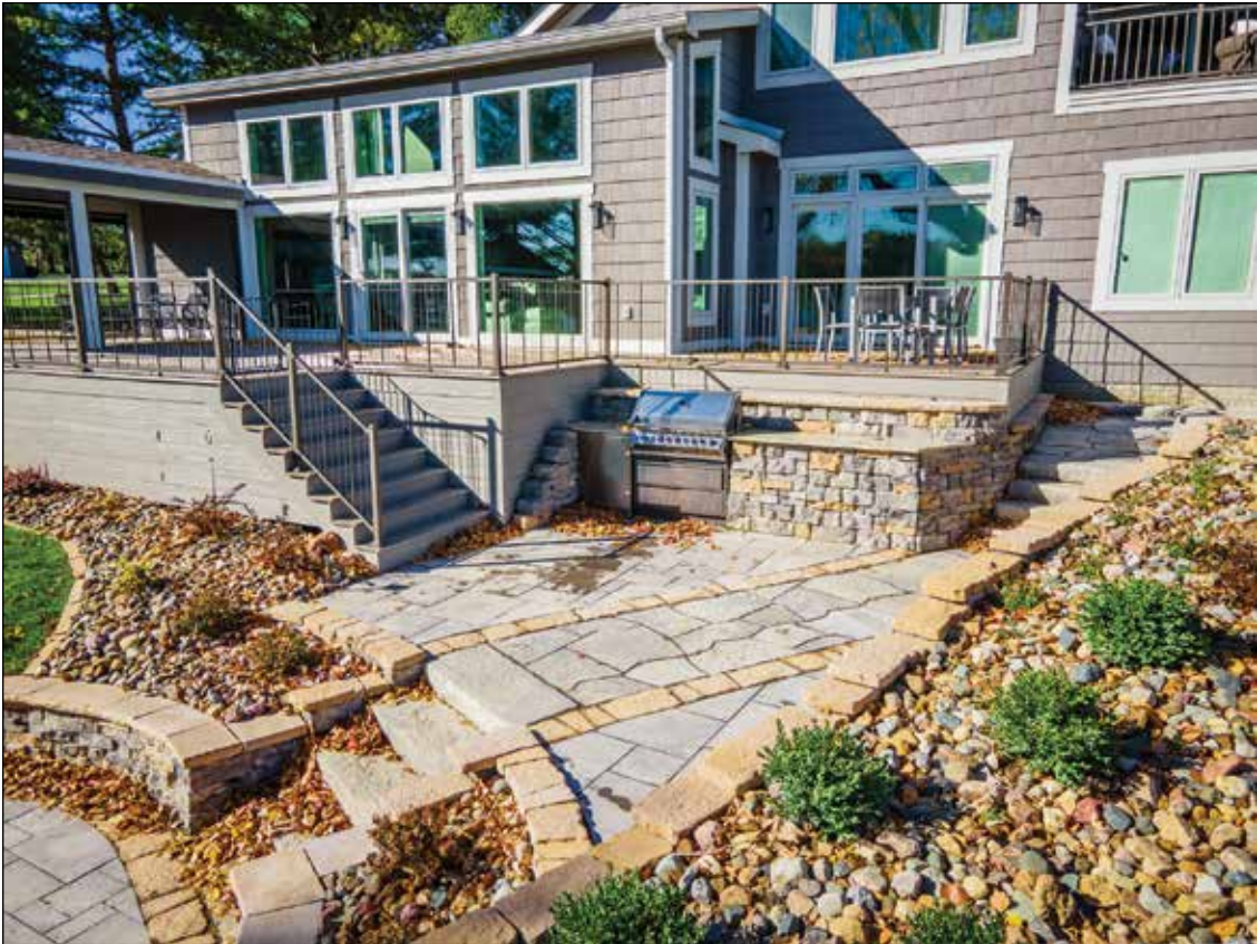
The backyard features an outdoor kitchen area complete with a grill and fridge.

With a spot on the lake like theirs, the Martins' outdoor gathering spaces will serve them well for years to come. ■