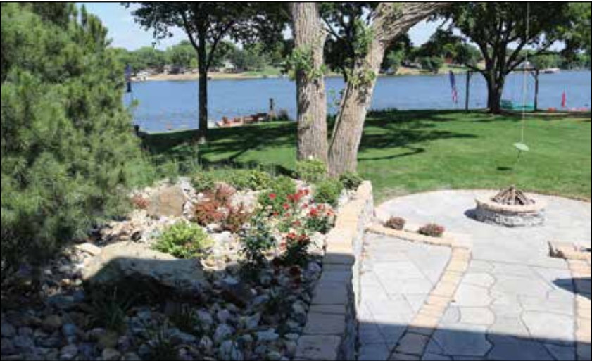
The Martins' view of the lake is unobstructed.

And whether they're gazing out at the lake from the deck, grilling burgers at the outdoor kitchen or chatting around the fire, the Martins plan to use the spaces as much as they can, including with their two daughters, who live in Ames.