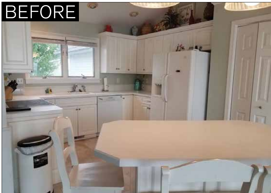
The old kitchen in the DeBruins' condo was outdated and mostly white.

Going into the project, the DeBruins knew they wanted new appliances, countertops and backsplash, but, as happens with many home improvement projects, the scope increased as time went on. The condo came with white cabinets, but after the couple got into the place, they realized they didn't care for the design. Thus, new cabinets were added to the plans. The DeBruins had other must-haves as well, including the incorporation of a more functional pantry.