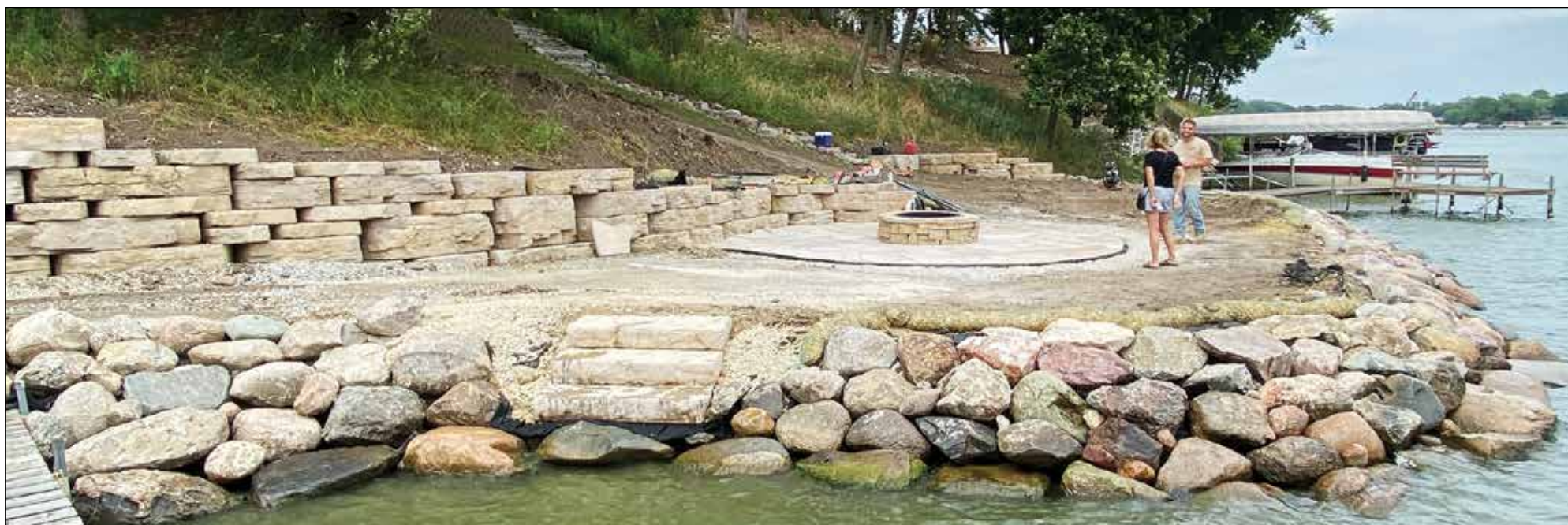
New shoreline riprap and a firepit area are the main reasons the Dahlquists underwent a landscaping makeover.