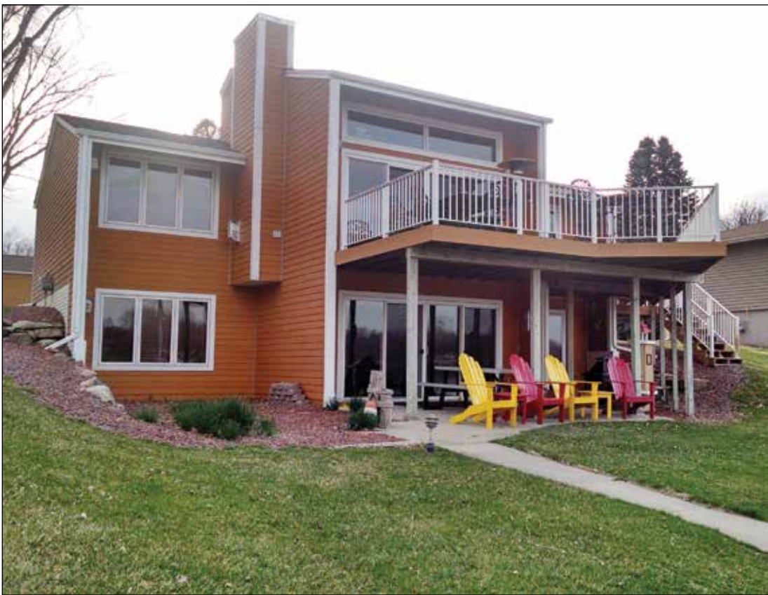
Before, the deck had an outdated railing and was in need of new flooring.