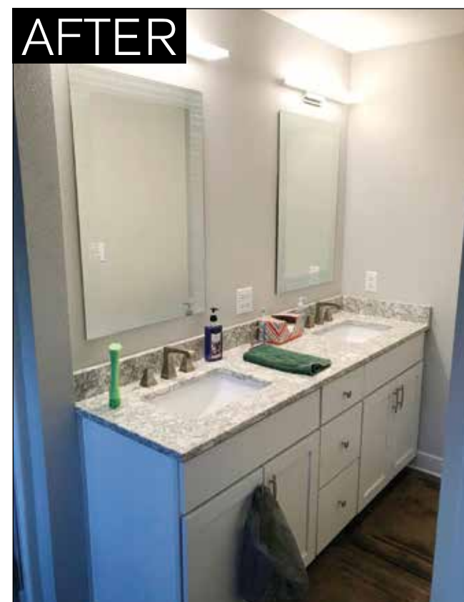
The upgrades to the dated look of the Tofteland bathroom included a double-sink vanity and more modern light fixtures.