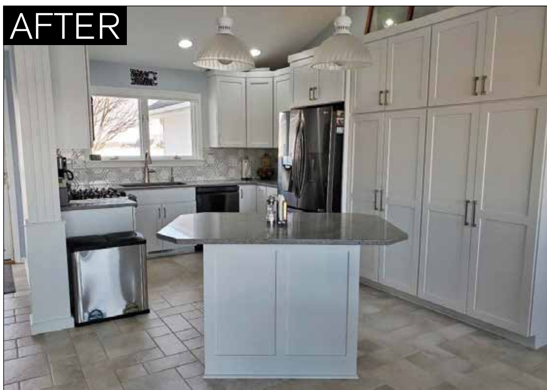
The DeBruins' new kitchen boasts a large pantry and black stainless steel appliances.