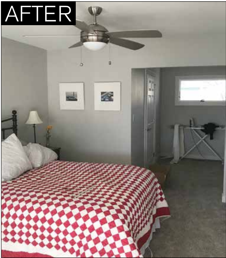
The Tofteland master bedroom was brightened up and opened up with the removal of dark wooden doors.