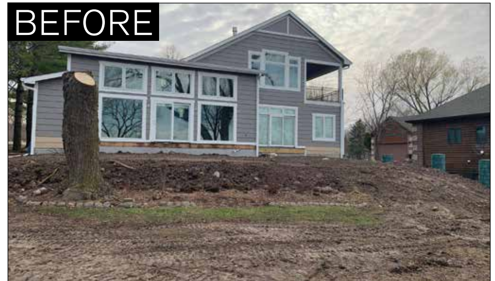
The Martins spend a lot of time at their Lake Panorama home, so they wanted a dynamic outdoor gathering space.

When you walk off their large back deck, which includes a screened-in area on the south side, you arrive at the outdoor kitchen area. Here, you'll find nearly everything you need to whip up a summer meal. There's the grilling island that features a Napoleon stainless steel built-in grill with seven burners and a rotisserie. The surrounding